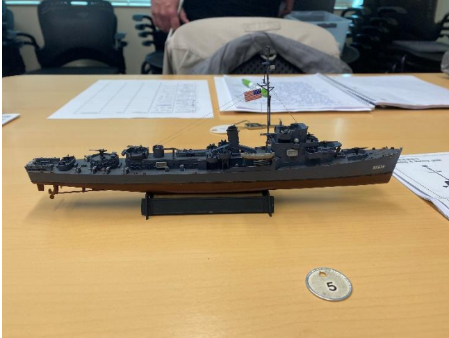
Tom E. – USS England Destroyer