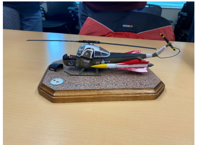
Tom P- Cessna Helicopter YH-41