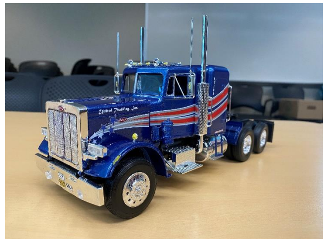
4 th Place – Dalton Semi Peterbilt 359