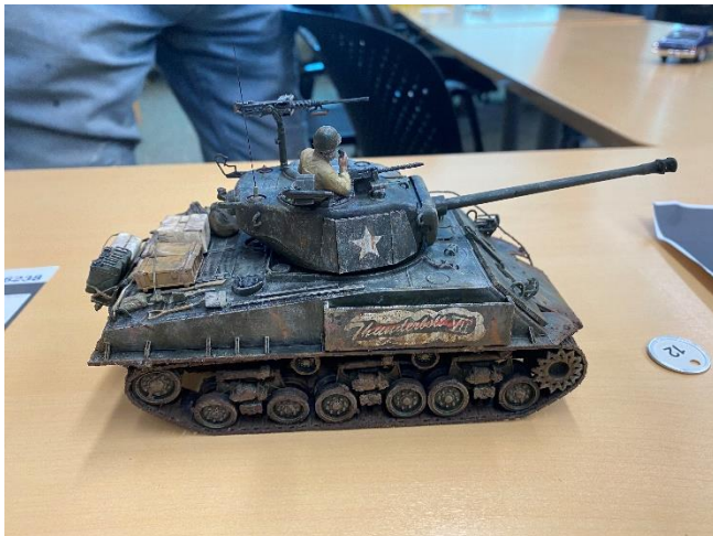
3 rd Place – Duane Sherman Thunder Bolt 8