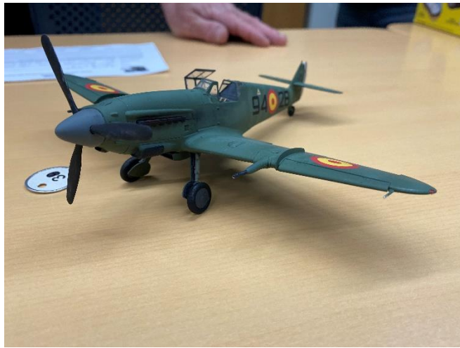
Larry- ME 109 G-6 aircraft